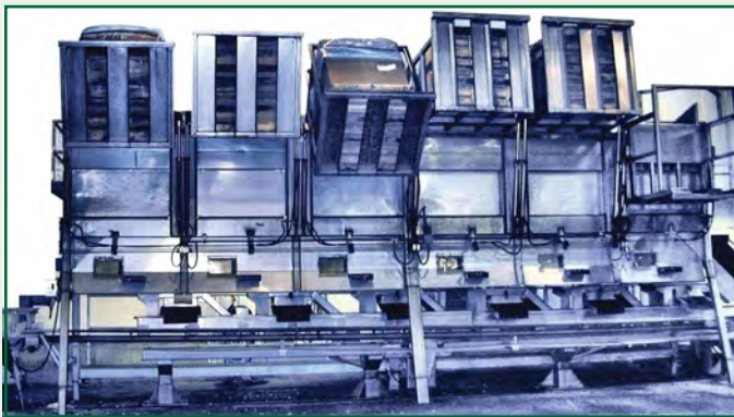
Six-Stage Mixed Vegetable Line